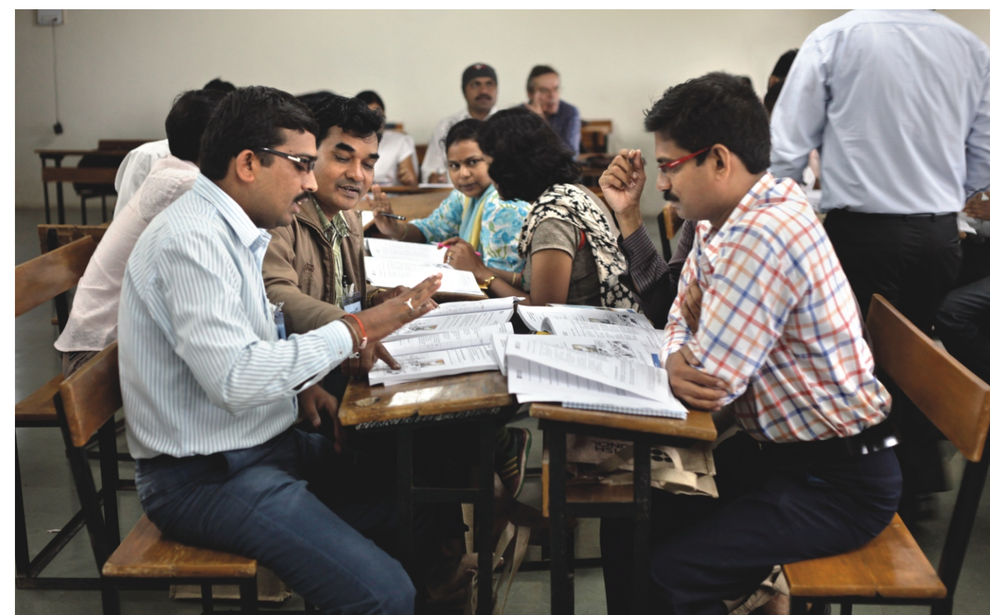
Maharashtra ELIPS Master Trainers discuss a group task in a MT training session in Lonavla, Maharashtra, India

In 2011, the Maharashtra state government requested the British Council to design a sustainable programme to develop both the language proficiency and methodological skills of primary teachers from grades 1 – 4. The English Language Initiative for Primary Schools (ELIPS) is the resulting large scale teacher education and development programme which aims to build capacity through face-to-face training and access to Continuing Professional Development (CPD) initiatives.